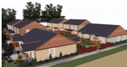
RENDERING BY BONN DESIGN Artists rendering of Juneberry Lane.

The Clackamas Community Land Trust broke ground in late September on 12 homes in Oregon City designed to be affordable and earn the Leadership in Energy and Environmental Design platinum rating, a set of green building standards.